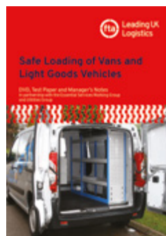
Safe Loading of Vans and Light Goods Vehicles DVD Code: 4466