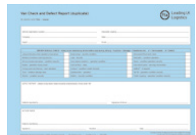
VAN40 Defect Report Pad - Duplicate Code: 7554

Please see our website for our full range of products and special offers. What's more, even if we don't currently stock something you require, you can get in touch and we will do our best to source it for you.