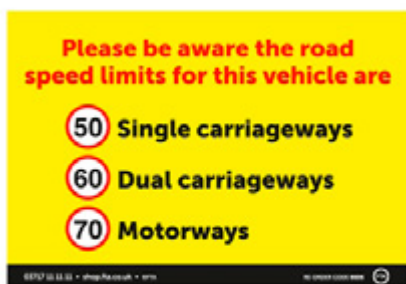
External Speed Sticker - Van Code: 6606