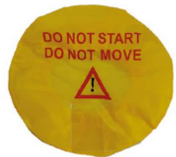
Stretchy Steering Wheel Cover 40cm Code: 7630