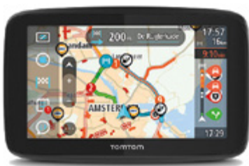
TomTom Pro 7350 Van and Car Code: 7199