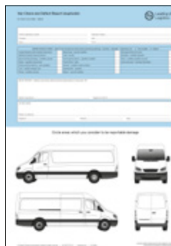
Van Defect & Damage Report Pad - Duplicate VAN40 Code: 7608